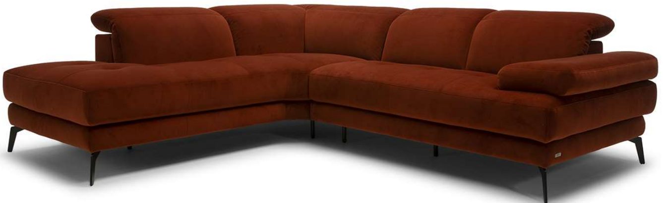
■ Vers. 480+017