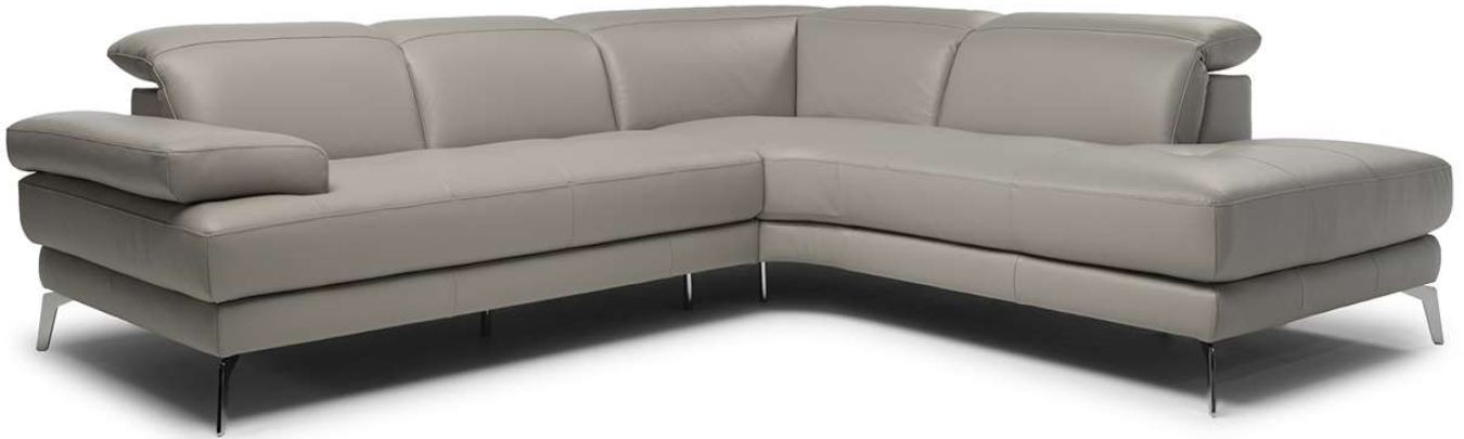
■ Vers. 286+481